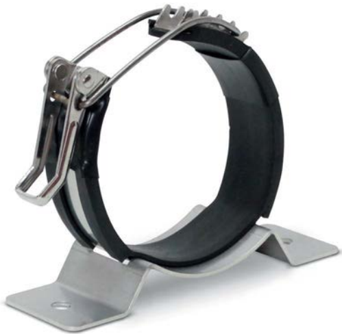
Small tension band with mounting bracket and multi striker for large differences in diameter. Application: Automotive test bench for different brake cylinders.