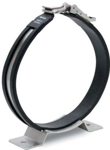
Fixation of cylindrically shaped bodies, in this case the fastening of gas bottles on vehicles.