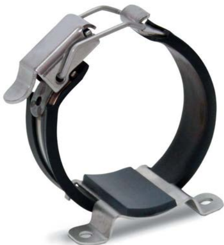
Special solution for racing, mounting bracket slotted outwards → Tension band can be removed.